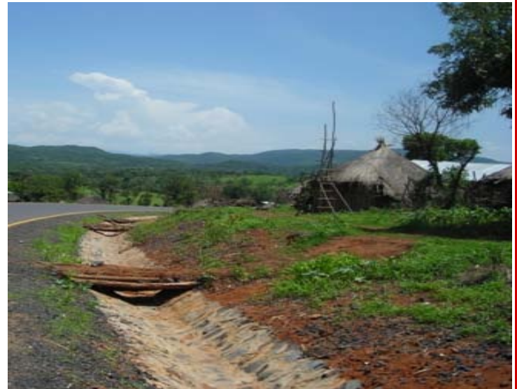
Village on the Nekempt – Mekenajo Road in Ethiopia

The Africa Region Transport Group (AFTTR) led the way in the World Bank when it included HIV/AIDS mitigating provisions within standard clauses for works contracts. Getting contractors to comply with the clauses has been challenging. The Ethiopian Road Sector Development Project (RSDP) , implemented by the Ethiopian Roads Authority (ERA) , was the first World Bank project to work closely with road contractors to include HIV prevention clauses into road contracts. The ERA implemented HIV prevention activities within its own workplaces and also reached out to contractors and communities near project worksites. These initiatives tested approaches to designing HIV prevention activities in road construction projects. Appropriate personnel, skills and funding are basic requirements for implementing HIV prevention activities.