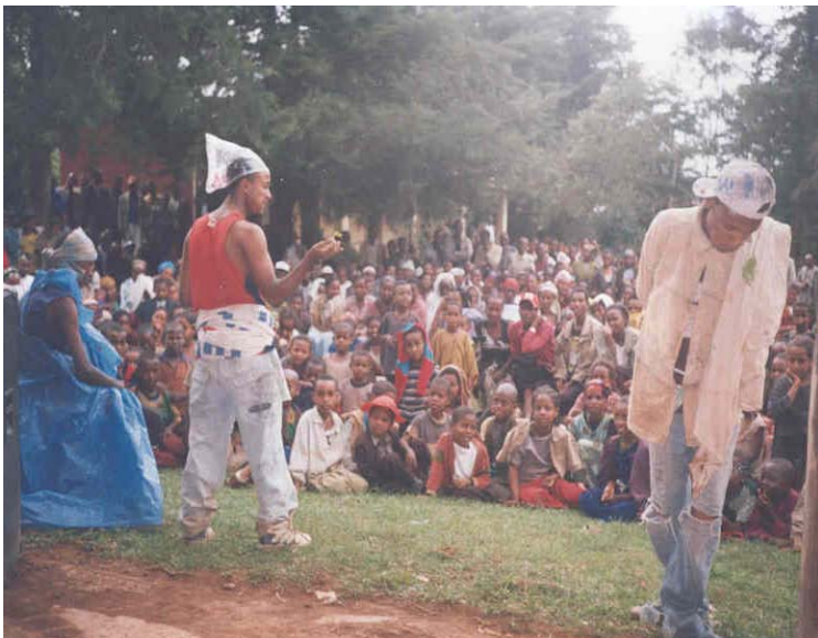
HIV Drama during Awareness Workshop, Alamata - Betemariam Road Project, Ethiopia

In late 2003, another survey of knowledge, attitudes and behaviors was carried out among 487 workers (ERA "Own Force" and contractors) and 380 community members living in the road corridor areas, supplemented by 25 focus group discussions and in-depth interviews with 33 key informants. All the workers and most community members had heard about HIV and AIDS, and over 80% gave correct answers to questions about how HIV is transmitted and how to prevent infection. However, about 70% of respondents perceived their own risk of infection as low, but the qualitative data indicated that sexual intercourse with non-regular partners was widespread, and condom use low: only 33% of the workers and 12% of the local community reported ever having used a condom. While the surveys in 2001 and 2003 are not fully comparable, they suggest that there has been progress in increasing knowledge and in changing attitudes, but that much more remained to be done to change behaviors.