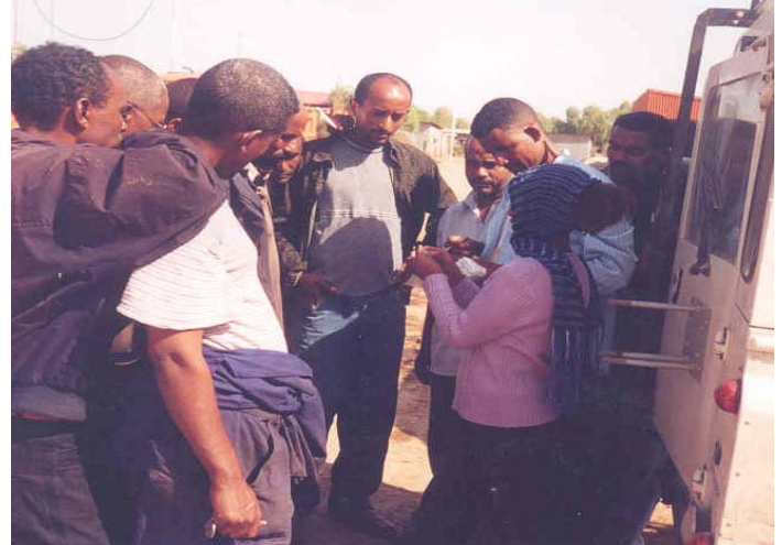
Condom Demonstration at Jijiga - Degehabur Road Project, Ethiopia

On September 23- 26, 2008, the ERA held its annual Road Sector Development workshop Two of the four days were dedicated to issues around safeguards. The effectiveness of compliance with environmental and social safeguards clauses, including HIV, and the difficulties of ensuring consistent supportive supervision were discussed. The latest ERA assessment of progress concluded that there is still room for improvement. Consequently, a committee has been set up to look into the issue, and develop specific recommendations. Two initial proposals were put on the table: impose monetary penalties for noncompliance, and/or make compliance a condition of project completion hand-over.