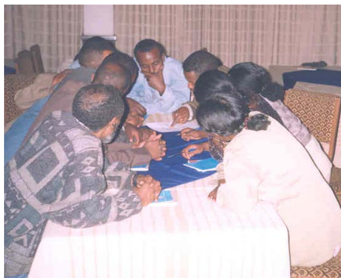
Peer educators in training, engaged in group work