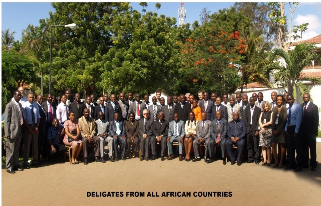
DELIGATES FROM ALL AFRICAN COUNTRIES

NYALI BEACH HOTEL , MOMBASA , KENYA 26-29 MARCH , 2012