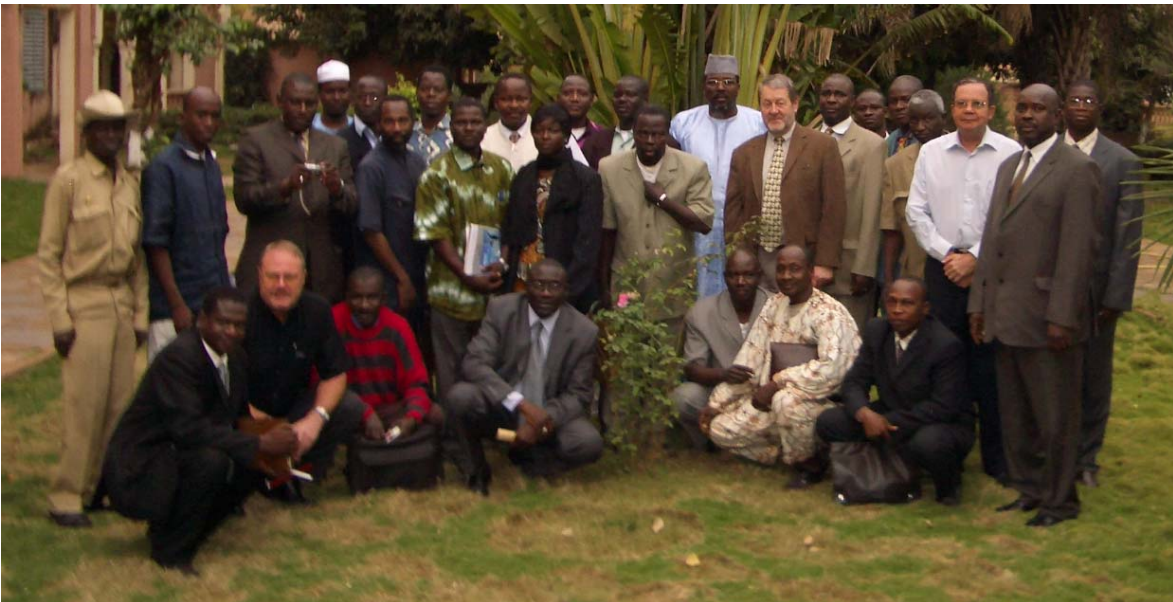
Participants attending workshop on Appropriate Pavements and Surfacing Technologies for Low-volume Roads that was held in Bamako, Mali, 15 – 16 February, 2006

3.3 The workshop was attended by some thirty four delegates including three each from Senegal, and Burkino Faso. The attendance list is attached as Annex C.