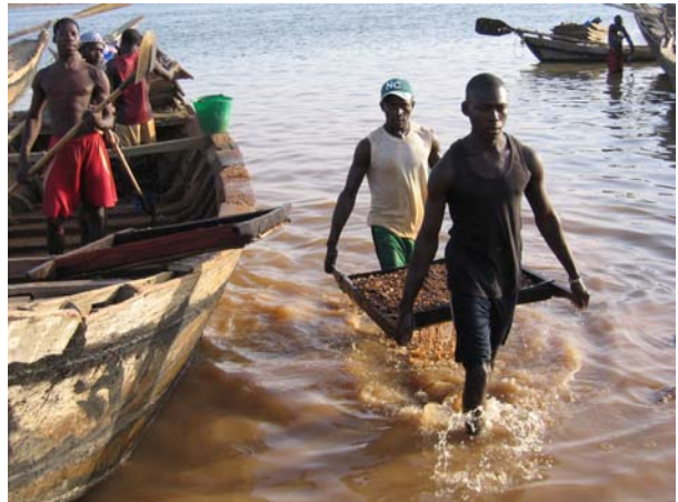
Off-loading and washing of gravel to remove fines prior to stock piling on the river bank